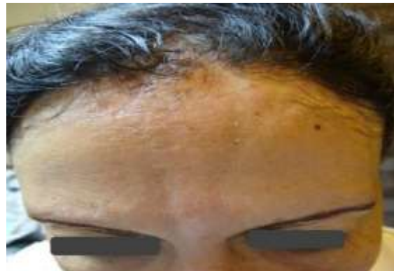
Fig (3) FFA; Anterior hair line recession, eyebrows affection, depressed facial veins.