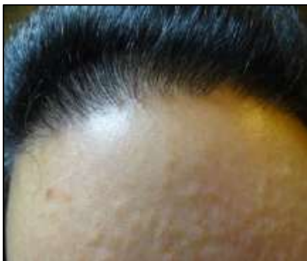
Fig (2) FFA with prominent facial papules.

Clinical examination revealed the following clinical signs: frontotemporal and frontoparietal hair recession, eyebrows and eyelashes loss, facial papules and depressed facial viens Fig (2,3).