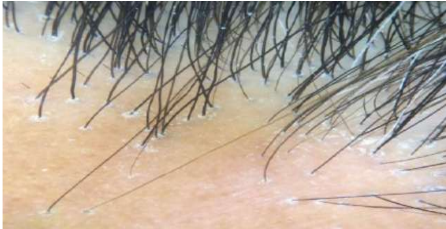
Fig (4) Trichoscopy shows loss of vellus hairs, loss of follicular opening, perifollicular scaling, inter-follicular scales and lonely hairs.