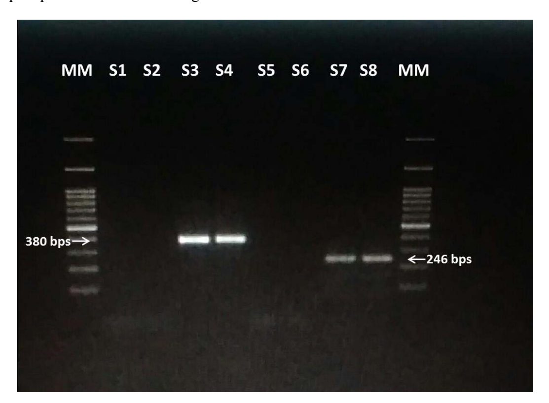
Figure 2 showed an amplification of 380 bp amplification demonstrating the