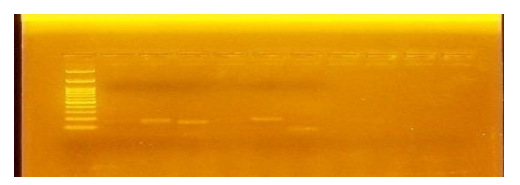
Fig (2) After rest.