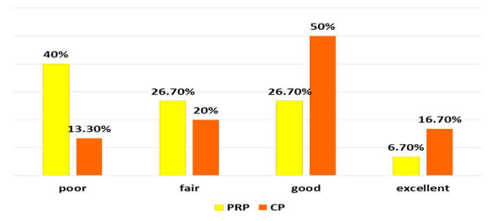
Fig (1) Response among studied groups.

Better response was significantly associated with CP group when compared to PRP group (p=0.038).