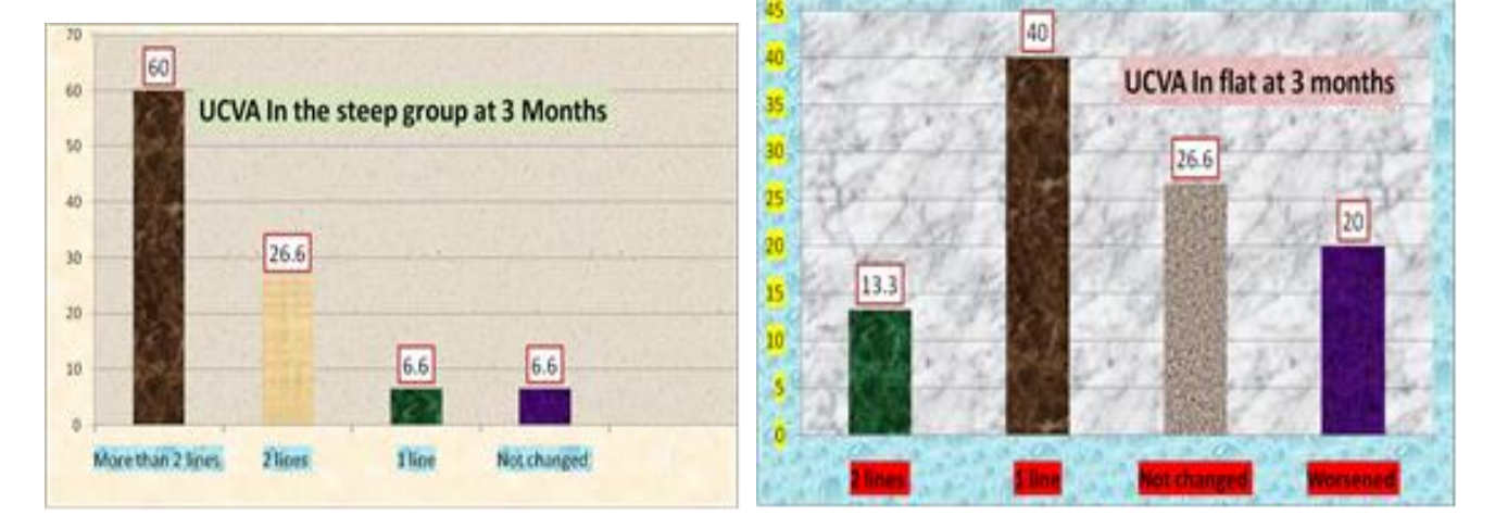
Fig (1) UCVA improved in the steep group

Post operative Refracive changes after 6 Month Fig (4) These results after we change the site of insertion in 9 cases after 3months from the flat axis to tradional site (steep meridian)axis. UCVA after 6 months improved in 90% of patients 50% gained more than 2 lines, 30% Gained 2 lines, 10% Gained 1 line, 10% showed no improvement. None patients were worsened at this group & BCVA was improved in 93.3% of patients,30% gained more than 2 lines, 53.3% Gained 2 lines and 10% patients Gained 1 line, 6.6% showed no improvement. None patients were worsened at this group of patients.