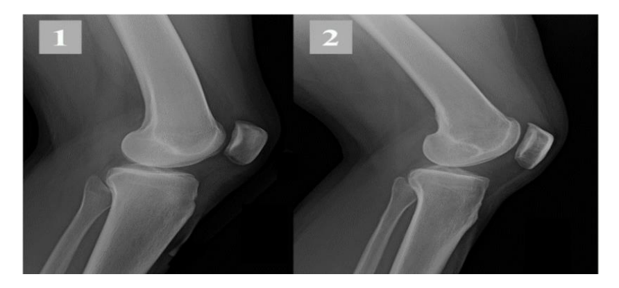
Fig (1) Lateral plain radiographs of knee showing < 6mm condylar overlap.