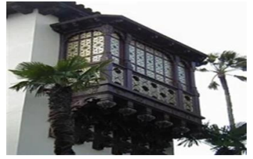
plate (1)illustratesMashrabiya design plate source https://andalusiat.com/

Finally, privacy is achieved thanks to its narrow lathe, which is made of intertwined and intertwined wooden parts. The mashrabiya moved from Egypt to some Arab countries and was sometimes made of materials other than wood, such as marble, plaster or metal.