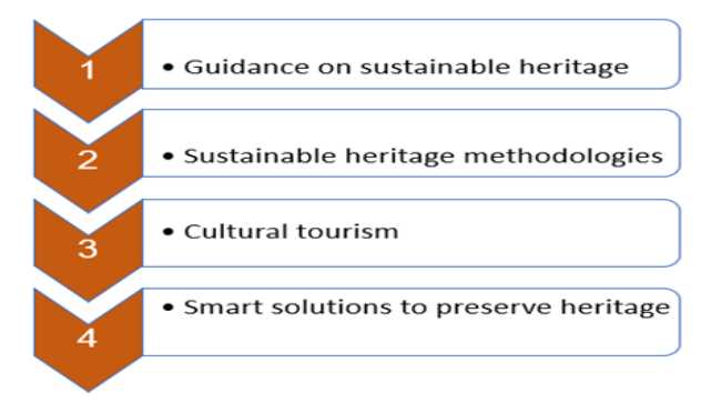
plate (2) illustrates leader ship axes in sustainable tourism development