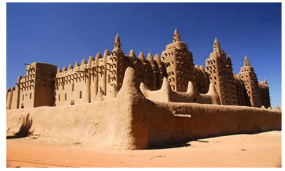
Figure (7)illustrates Adobe is the best building material

Especially in Egypt and the Maghreb countries, where wood and stone are scarce, and it is known in Egypt as red brick, and it is used in building load-bearing walls or as shoulders or in building domes and vaults, and in the case of building it with a large thickness, it helps to provide good thermal insulation of the internal spaces of the building. In the Islamic architectural heritage, we find that they were achieving this principle, environmentally friendly buildings have been in existence since the past, and the achievement of the principle of sustainability has been present since the past as well, as they used in their construction the local materials available to them, and took care of the availability of natural lighting and ventilation, they were preserving the environmental rights, And the rights of future generations.