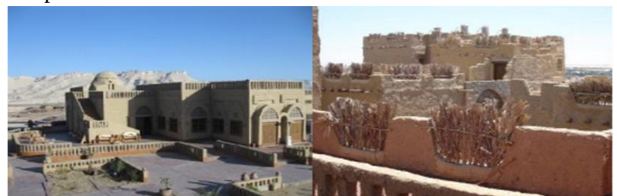
plate (5) illustrates The use of natural materials in building materials

The walls of the rooms from the inside and outside are lined with mud and straw for two reasons. The first is to preserve the shape and appearance of the hotel in the style of countryside, and the second reason is to maintain the room's climate in cool summer and in the winter warm, whatever the temperature of the air.