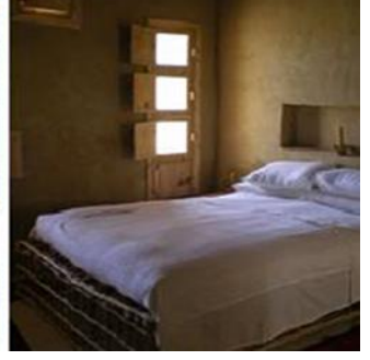
Plate \, (8) illustrates Local raw materials in building materials and furniture