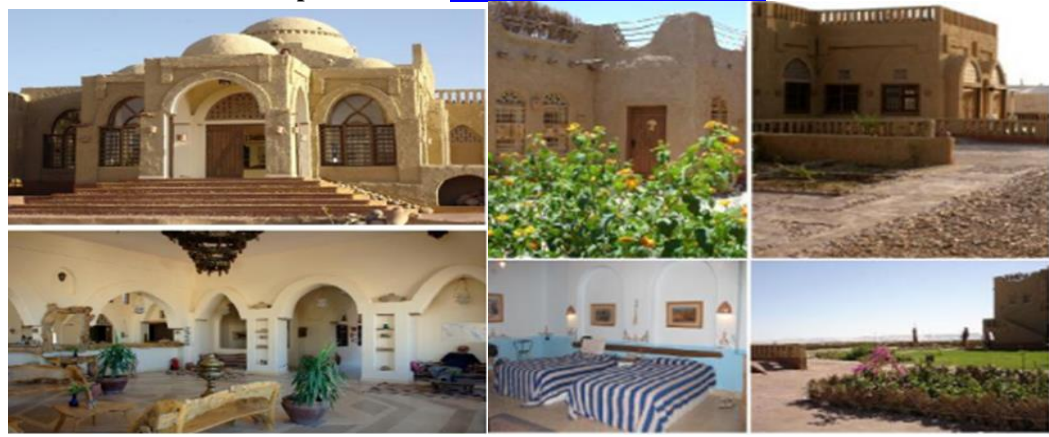
Plate (6) illustrates The rooms and the residence area & reception building of the hotel