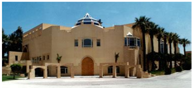
Plate (4)Palace Arts, Opera House of

the distinct treatments of the Islamic heritage vocabulary to express the needs of contemporary society