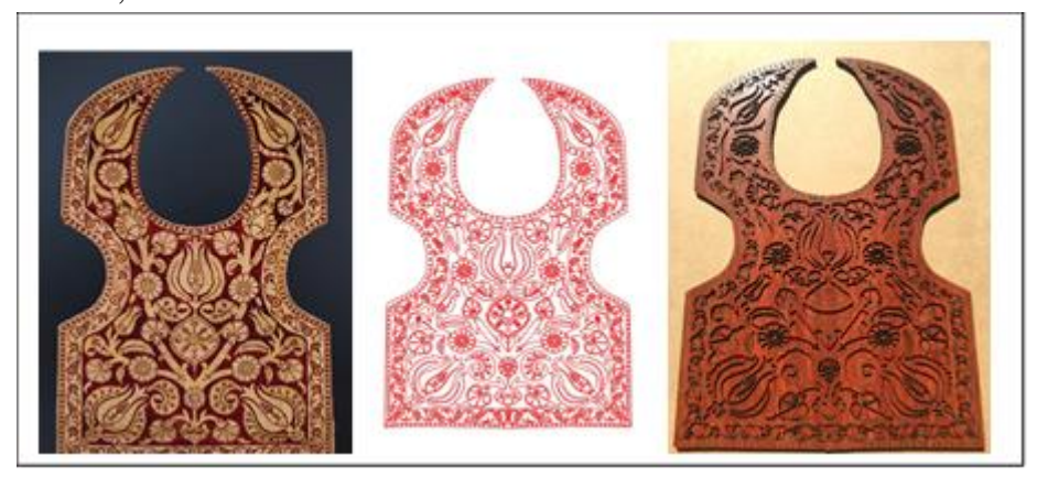
Figure (5): The original artifacts (to the left side), Digital drawing (in the middle) and the applied copy (To the right side).

The project become real and the roles were determined. Dr. Walaa sent to the author pictures of many museum's artifacts and communicated with many for sponsoring. The author selected the most suitable pieces, then presented and discussed the idea with a group of distinguished students who agreed and worked under his supervision on converting the pictures into technical measurable digital drawings that can be dealt with by digital drilling or cutting ... (Figures 5-14). The project was running with the trials of digital drawing (which modified many times), carving and inlaying where the decision of the author (the project supervisor) is to select the flattest surfaces artifacts (2D objects) as a beginning stage then moving to the 3D objects which needs more efforts, trials and costs.