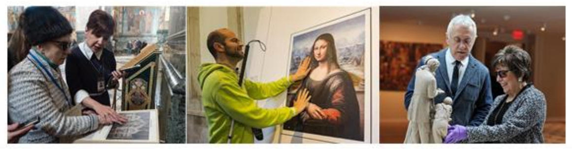
Figure (4): Being able to touch copied artifacts is not a new concept which is applied in many museums worldwide to help visually impaired visitors.

Indeed, being able to touch museum artifacts is not a new concept (Figure 4). The Victoria and Albert Museum in London (V&A) has been offering tactile sessions for visually impaired visitors since 1985. The museum runs special events throughout the year which cater to this audience. The program changes often and focuses on a variety of the museum's collections. This strategy encourages visual impaired visitors to come back for repeating visits and enjoy new experiences (For more details see, Ginley, 2013).