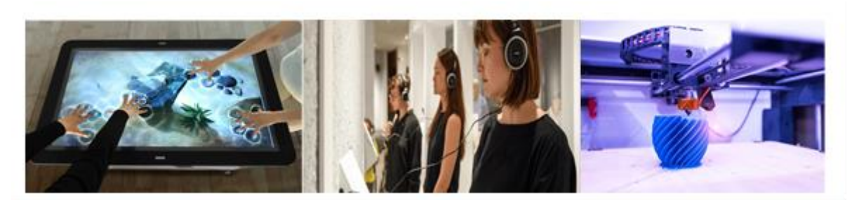
Figure (3): Using tactile exhibitions, audio description and 3D printed copies are developing and enhancing visually impaired visitors' experience.

Indeed, being able to touch museum artifacts is not a new concept (Figure 4). The Victoria and Albert Museum in London (V&A) has been offering tactile sessions for visually impaired visitors since 1985. The museum runs special events throughout the year which cater to this audience. The program changes often and focuses on a variety of the museum's collections. This strategy encourages visual impaired visitors to come back for repeating visits and enjoy new experiences (For more details see, Ginley, 2013).