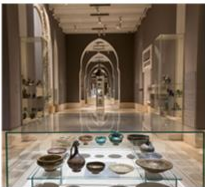
Figure (2): Museum of Islamic Art, Cairo. Inner courtyard and one of the interior halls.