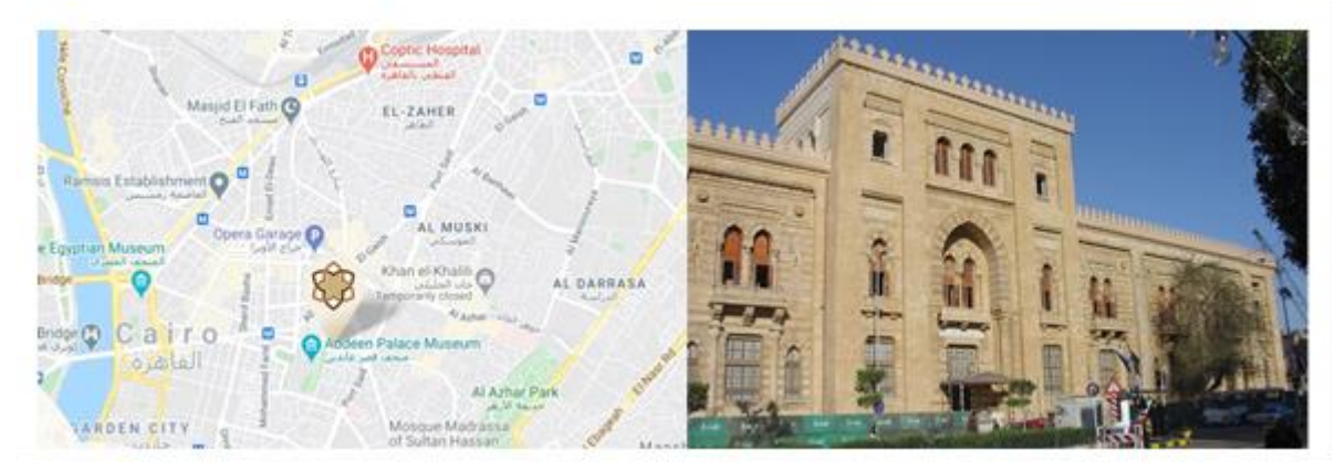
Figure (1): Museum of Islamic Art, Cairo. Location and main façade.