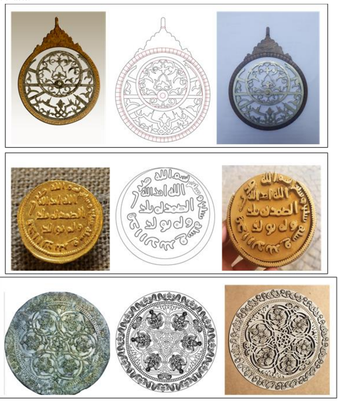
Figures (6), (7) and (8): The original artifacts (to the left side), the digital drawing (in the middle) and the applied copy (To the right side).

as the author (project supervisor) and his group of students worked as volunteers of time and effort, but materials and the cost of working in addition to transportation costs prevented the transition to the second stage, which is the production of the copies of three-dimensional artifacts.