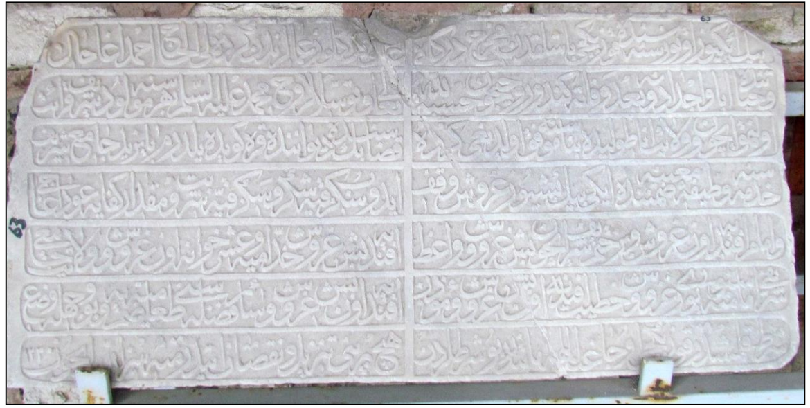
Plate (1) Shows the white marble endowment No. 63 preserved in Topkapı Palace in Istanbul

each of which was divided into two rectangular framed written areas<sup>(c)</sup>. The inscriptions indicate that the owner was an official in the palace and the endowment was to support serving some buildings outside Istanbul.