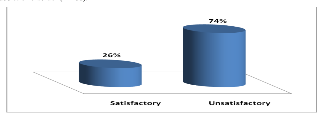
Figure (2): The total practices scores of the secondary schools students regarding internet addiction disorder (n=200).