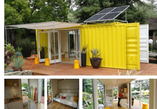
Ecological, Sustainable Cargotecture. Ref. (15)