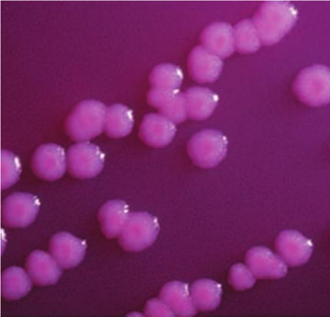
Figure 2. MacConkey agar showing mucoid, lactose fermenting colonies.