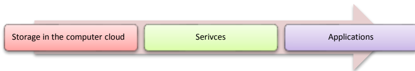
Figure (1) : Called cloud computing or cloud computing C. C

The idea of cloud computing Cloud Computing :