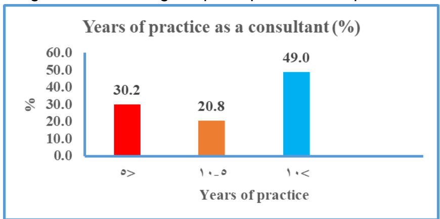
Figure 2. Percentages of participants by years of experiences Pattern of distribution of scores on the KCAHW questionnaire among participants

Table two displays the total mean score on the KCAHW among the medical consultants that participated in the study which was low 11.9 \pm 3.0 . Moreover, the highest mean total score was displayed in Domain 1, which is concerned with questions in the area of social interaction and was 6.4 \pm 1.6 . The mean total score in Domain 2 which addresses