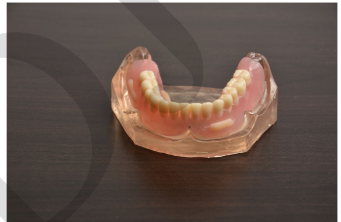
Figure 2: showed mandibular overdenture after finishing and polishing.