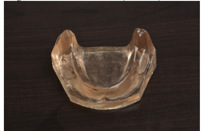
Figure 1: showed an edentulous mandibular heat cured acrylic resin model without ridge undercuts

attachment systems was done using ANOVA followed by Tuckey post hoc test with adjustment for many comparisons. Significance was set at P \leq 0.05 . Analysis of data was done using IBM SPSS statistical software (version 23).