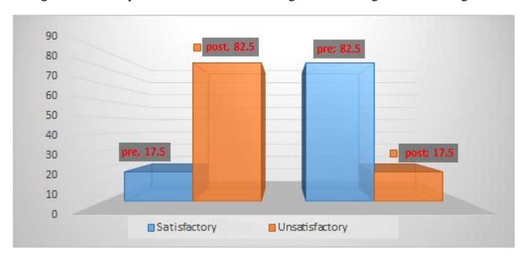
Figure (2): Mothers' level of reported practice about care of their children with congenital heart diseases before and after teaching sessions

Figure (1) shows mothers' level of knowledge about care of their children with congenital heart diseases before and after teaching sessions. It reveals that 82.5% of mothers had poor knowledge before teaching sessions compared to only 10% of them after teaching sessions. Furthermore, none of the mothers have good knowledge score before teaching sessions compared to 67% of them have good knowledge after teaching sessions.