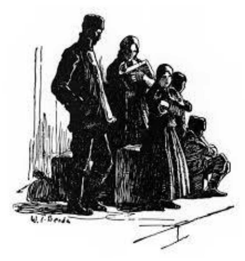
Line Drawing (1) of My Antonia: The Shimerdas Family

and a girl stood holding oil-cloth bundles, and a little girl clung to her mother's skirts" (Cather, 1994 [1918]: 34).