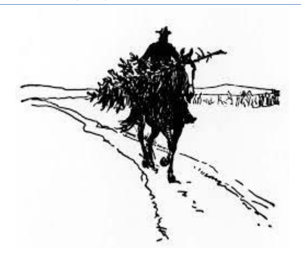
Line Drawing (4) of My Antonia: