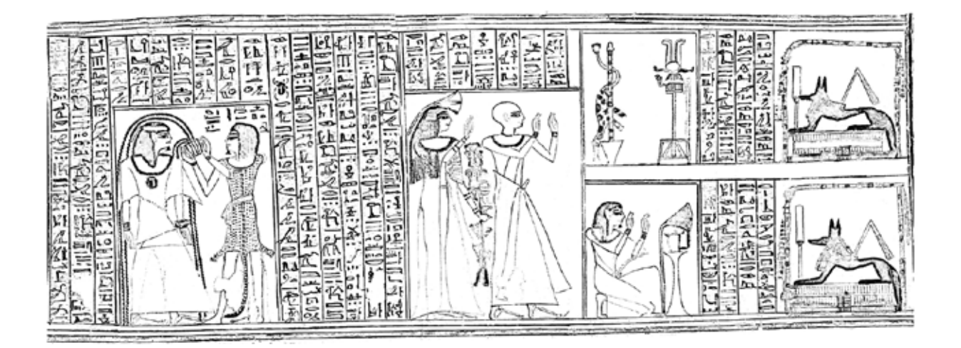
(Fig. 2) Spells 195V - 138V - 185V.

The second spell is BD 185, formerly dedicated to Osiris, but here it is Anubis the center of attention. The deceased is kneeled in front of an offering table adoring two images of Anubis in the form of jackals with sekhem scepters and flails, lying within two pavilions over pylons. The introductory label is over the vignette of the previous spell instead of the former, and indicates the adoration of the ka of Osiris in order to receive offerings. In front of the pavilions, the texts worship Anubis who grants everlastingness, not dying again and free movement after vindication.