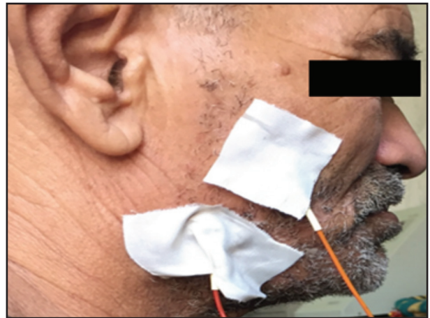
Figure (2) Electrodes of the electromyogram on the masseter muscles

Electromyographic activity measurement was done as follows: One month later each set of occlusion adapted by the patient, electromyographic activities of muscles were tested. Surface electromyographic records were got from the right and the left masseter and right and left temporalis muscles by an electromyographic machine. The set used included a stimulator, oscilloscope, amplifier, filter and gain. Electrodes transmitted signals to the main unit. The signals were amplified, filtered and displayed on the oscilloscope then printed on paper. The electrodes were silver chloride disc electrodes soldered into a conducting wire. (Fig 2,3)