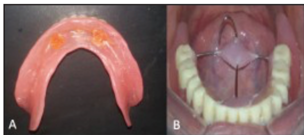
Figure (2): (A) Retention sil 600 in the denture fitting surface. (B): Measurement of denture retention using digital forcemeter

Data were presented as mean & standard deviation. Statistical analysis was performed with SPSS 16® (Statistical Package for Scientific Studies), graph pad prism & windows excel. Shapiro-Wilk tests was used to assess data normality and showed normal distribution.