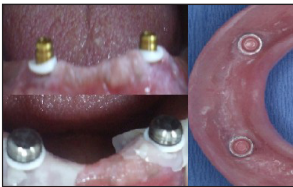
Figure (1): Chairside direct pick up procedure for locators abutments

conventional metal housing and nylon caps, Group II: overdentures were pickup with silicone housing retention sil (Bredent medical GmbH &Co. KG, Germany). Indelible pencil was used over the locator to act as a guide of area to be relieved from the fitting surface of the denture opposite to it. Relieving enough space to accommodate the locators should be done to ensure complete seating of the denture during pick up procedure. For Group I A small hole was made at the lingual flange to allow the excess relining material to escape. A rubber dam sheet and white block out spacers were slipped around the locator abutments to facilitate the pick-up procedure. The metal housing with a black processing cap was placed directly over the locator abutments. A chairside hard relining material was used for direct pick-up. The denture was seated in the patient's mouth. After complete setting of the relining material, the denture was removed from patient mouth and the excess was trimmed and application of pressure indicating paste was used. Finally the pink nylon caps replaced the black processing cap using locators' tool. (Fig.1)