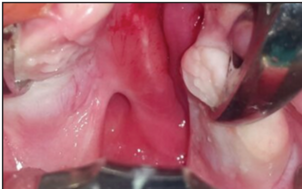
Figure (1): Oral cavity was widely opened by using Dingmans retractor