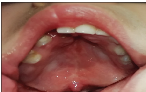
Figure (2): Intra oral photograph for the palate after 6 months of repair