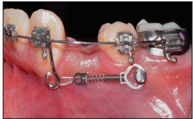
Figure (1): Canine retraction mechanics

canine lines and the central fossae line -a line passing through the central fossa of the right and left second molars- were measured. The patients were given a questionnaire and asked to assess the level of pain after 1 hour, 12 hours, 24 hours, and at days 3, 5 and 7 following the intervention procedure and after the first canine retraction with a numeric rating scale (NRS). The NRS was also used to rate the satisfaction of the BMSCs' aspiration and injections procedures and their easiness, fig (1).