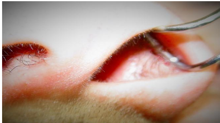
Figure (3): Intraoperative view of the limited marginal incision, the site of insertion of alar batten graft