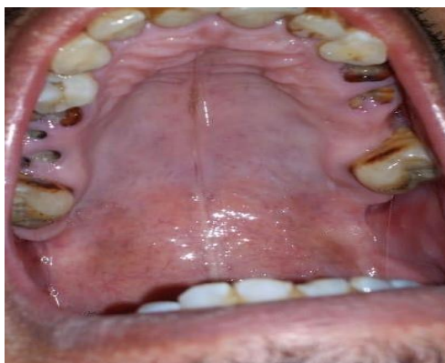
Fig. 1: Showing upper right and left remaining roots due to severe dental caries and bad oral hygiene

The participants in the research were adults over 18 years of age who had sinusitis of dental orange (figure 1). The exclusion criteria were for those who had sinusitis other than dental origin such as pansinusitis or nasal polyps.