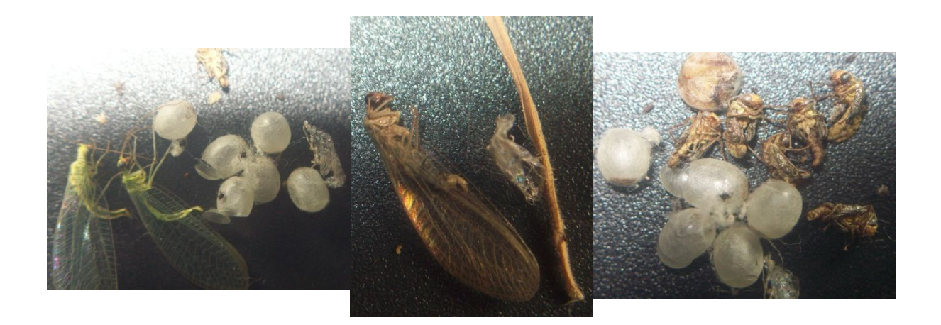
Fig. 3. Malformed adults resulted from eggs treated with LC<sub>50</sub> (92.3 4 ppm)