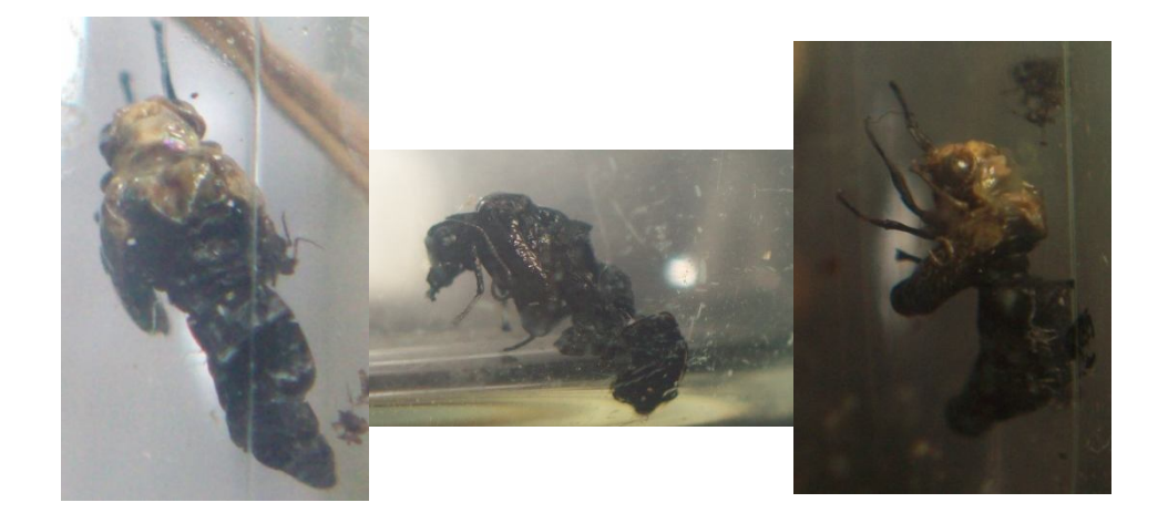
Fig. 2. malformed adults resulted from eggs resulted from adult treated and sequence treated by LC<sub>50</sub> of chromofenozide with LC<sub>50</sub> (62.24ppm).