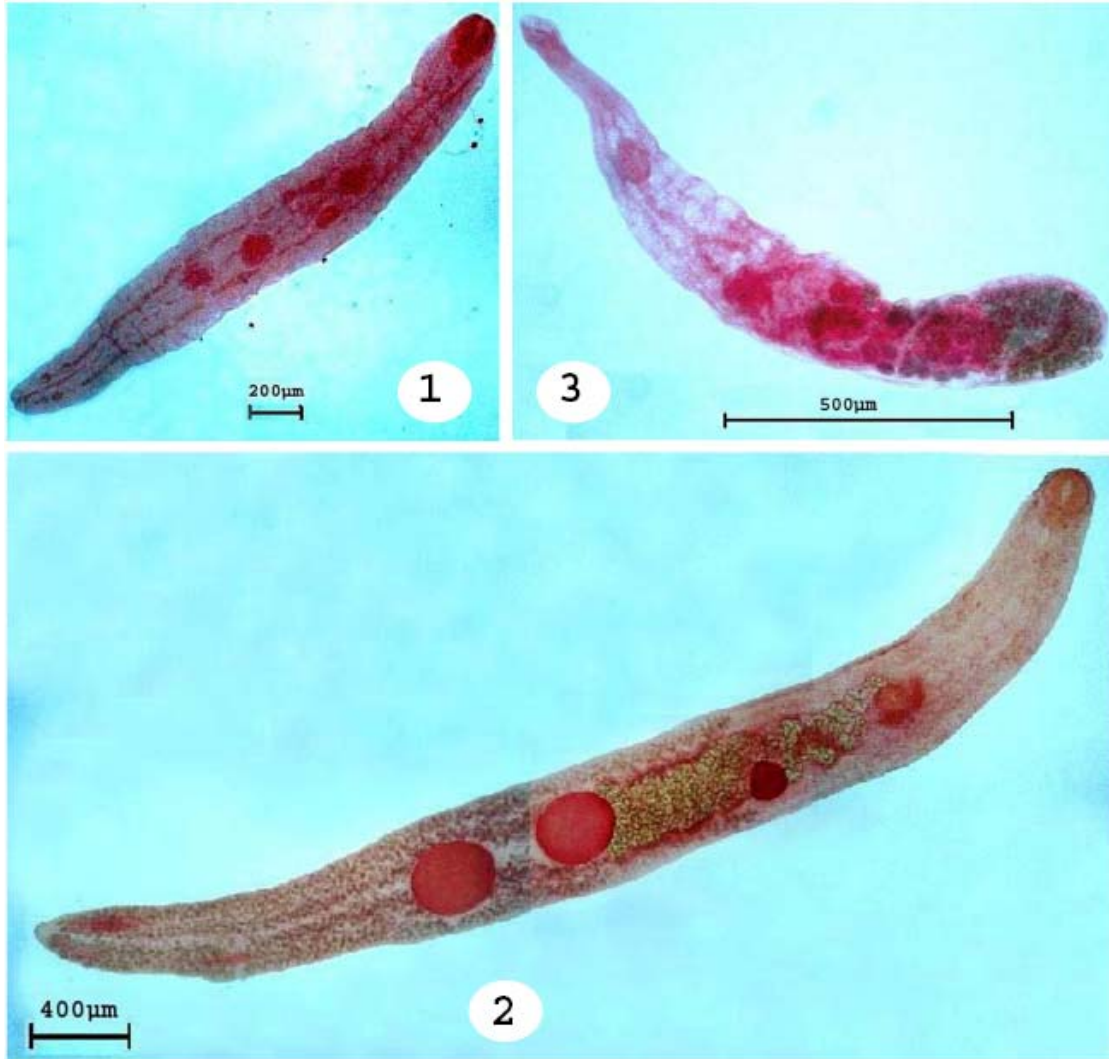
Fig. 1: Photomicrograph of immature stage of Neolepidapedon ( Neolepidapedon ) macrum from emperor fishes, Lethrinus nebulosus .