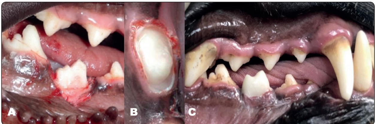
Fig 1. (a) 1.5mm occlusal & 1mm axial reduction for mandibular 3rd premolar, (b) circumferential shoulder finish line and (c) cemented crown in place

Correlation analyses were performed to analyze the relation between Caspase-3 gene expression level at 3 and 6 months to identify the effect of time factor and the result was that there’s no correlation exists.