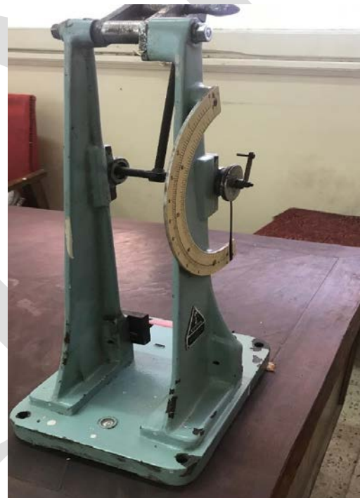
Figure 3: Specimen mounted on Charpy's impact tester.