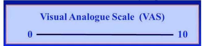
Fig. (1): Visual analogue scale one of universal pain assessment tool.

The mark corresponds to the level of pain intensity the patient presently felt at that moment. The distance in cm from the low end of the (VAS) to the patient's mark was used as numerical index of the severity of pain.