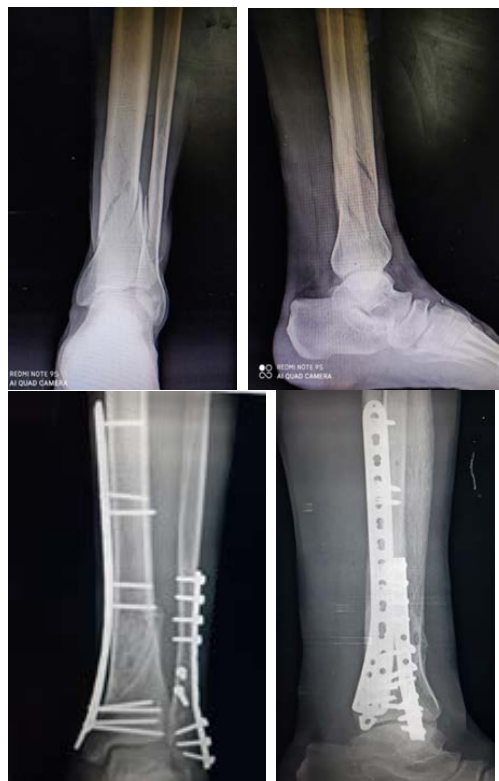
Fig.4: male patient aged 40 years old had a fracture distal both bone leg after RTA that was classified as 43-A2 according to AO classification. Operated using the MIPO technique with preoperative radiographs and follow-up after 6 months X-ray showing complete union of the fracture.

Our results were evaluated by Independent t-test and Chi-square test. P value < 0.05 was considered statistically significant.