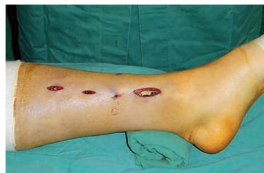
Fig.2: MIPPO technique requires only small incisions.

Group B: Distal tibial locked plate with MIPPO technique: Patients were positioned supine on a radiolucent operative table with elevation of the contralateral iliac crest. A 2-3 cm incision was made along the antero-medial aspect of the tibia distally at the level of the medial malleolus and proximally about 2-3 cm incision proximal to the end of fracture line. A subcutaneous extra periosteal tunnel was created using a Cobb dissector to introduce the plate. Percutaneous closed reduction of the fracture was done by manual manipulation, percutaneous clamps or fixator assisting reduction. The distal screws were then inserted, two screws were usually inserted one over the medial malleolus and one right below the fracture site, the later screw helps in bony reduction, taking advantage of the anatomical configuration of the plate. With preservation of reduction, proximal screws were taken through small incisions, then the remaining distal screws. (Fig. 2). Care must be taken during closure of subcutaneous tissue to cover the plate properly, and skin not to be under tension.