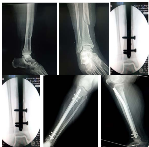
Fig.3: A female patient aged 38 years old had distal tibia fracture after falling to ground that was classified as 43-A1 according to AO classification. Operated using ILN with preoperative, intra-operative radiographs and follow-up after 6 months X-ray showing complete union of the fracture.

At 24 weeks (6 months): Follow-up X-rays were obtained. If full union occurred, patients were instructed to start full weight bearing. Olerud and Molander scoring system was recorded.