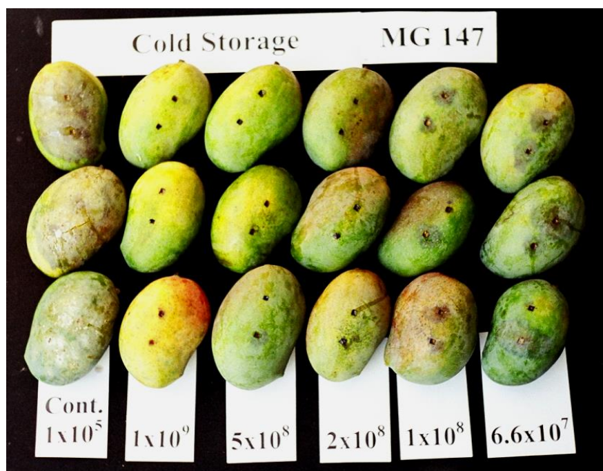
Photo 2. Development of Lasiodiplodia rot in wounded mango fruit treated with different concentrations of washed yeast cells of the best tested isolate and challenged with conidia of L. theobromae , then stored at 16±1°C for 14 days.

(6) Means followed by the same letter are not significantly different according to Duncan's multiple range test (p = 0.05).