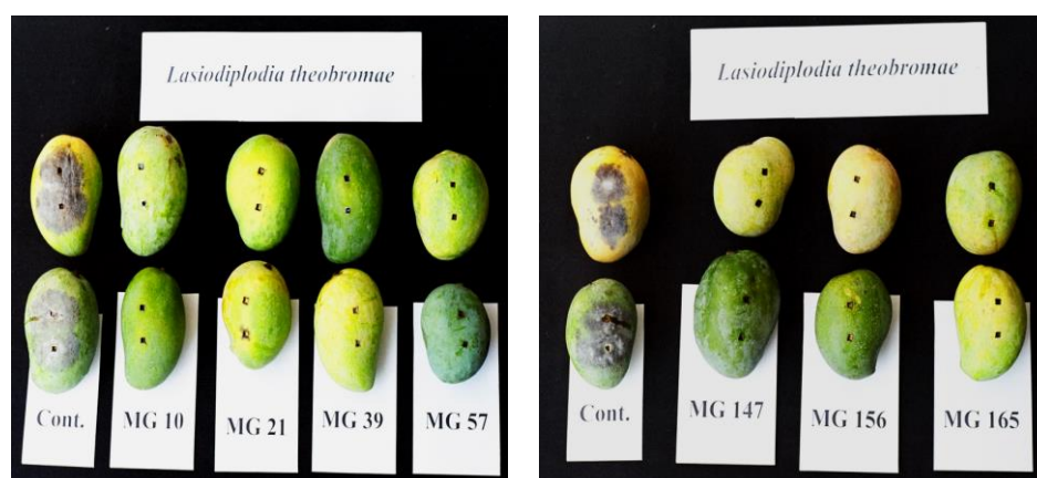
Photo 1. Development of Lasiodiplodia rot in wounded mango fruit treated with different yeast isolates and challenged with conidia of L. theobromae , then stored at 23±1°C for 6 days.

(5) Wounds treated with sterile fresh NYDB and pathogen spore suspension were used as control (check).