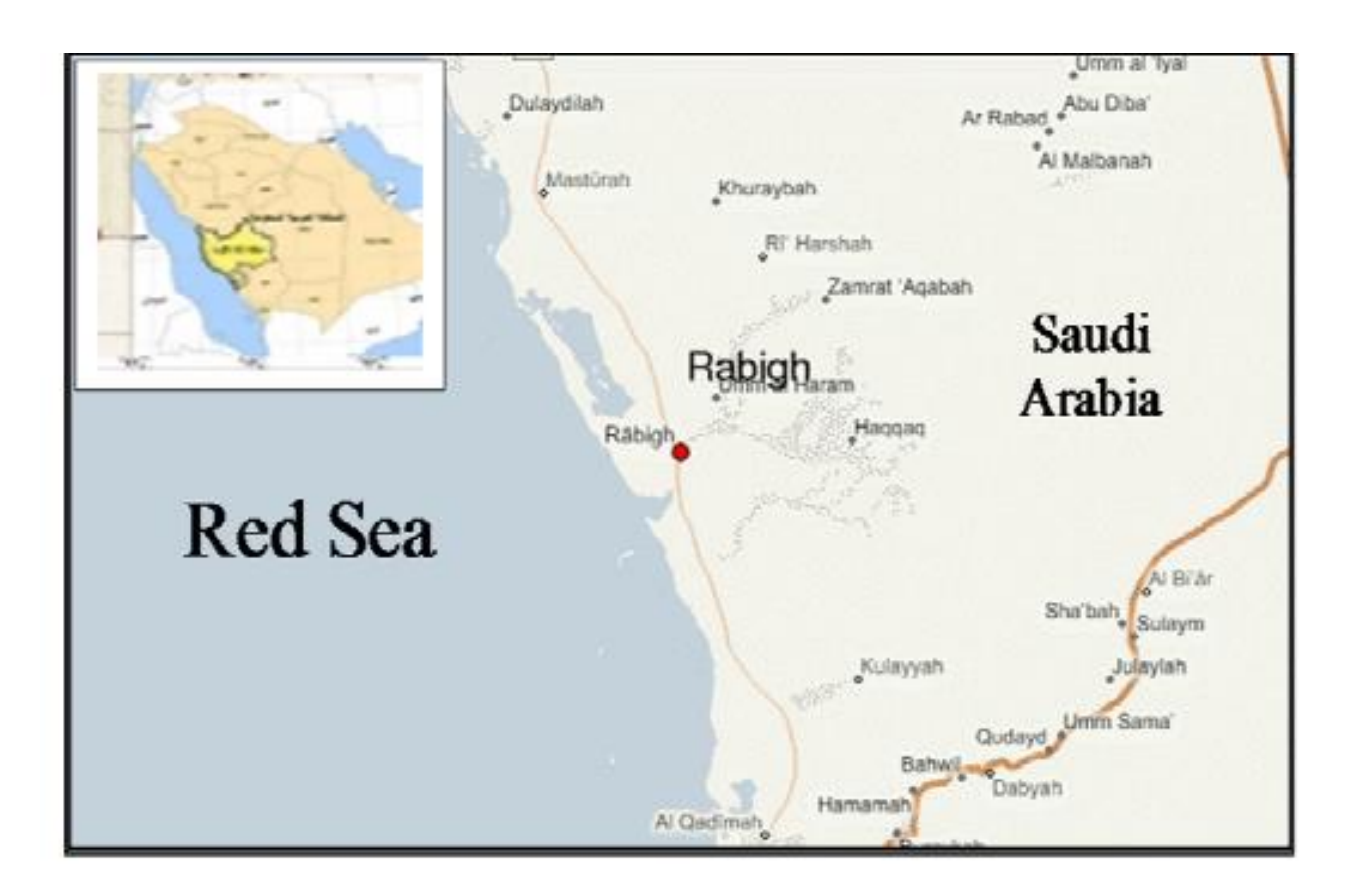
Fig. 1. Location map of the study site, Rabigh Governorate, West of Saudi Arabia