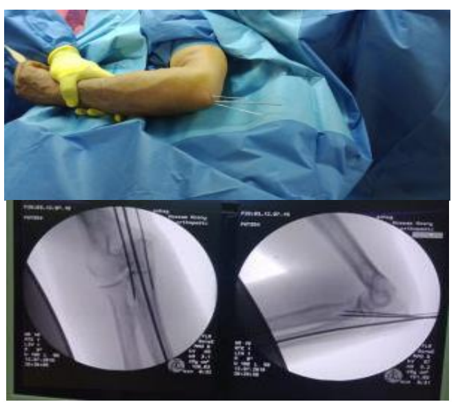
Figure (1): Provisional fixation is obtained with two parallel bicortical 1.0 mm k-wires then placement of an intramedullary 2.8 mm guide wire.