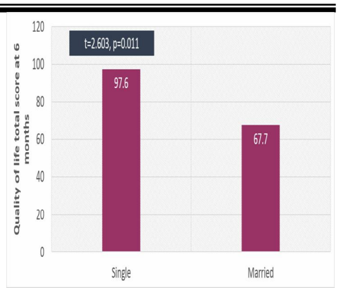
Figure 1 the association between the marital status and the MENQOL total score at 6 months of the intervention group.

Figure 2 illustrates the association between the BMI and the MENQOL total score at 6 months of the intervention group. The MENQOL total score at 6 months shows significant association with BMI (r=0.273, p = 0.018).