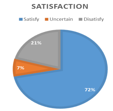
Figure 2: Frequency distribution of the study sample according to satisfaction

Figure 2 : Illustrates that the most of students 72% were satisfy after intervention from the effect of cinnamon but 7% of them were uncertain while the minority 21% were dissatisfied.