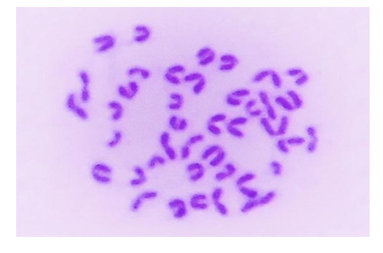
Fig. (2): Photomicrograph of normal metaphase spread from bone marrow cells (1000 X magnifications) of mice in the control group showing normal chromosomes.

Fig. (3): Photomicrograph of metaphase spreads prepared from the bone marrow cells (1000 X magnification) of mice orally treated with 2-butoxyethanol at different doses induced: ring chromosome (black arrow), fragments (blue arrows) & centromeric attenuation (red arrow). Quercetin was found to reduce this percentage and its effect was better at 14 days than that of 7 days.