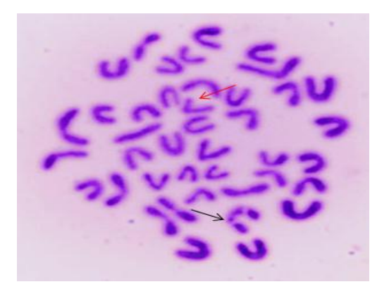
Fig. (4): Photomicrograph of metaphase spreads prepared from the bone marrow cells (1000 X magnifications) of mice orally treated with 2BE at different doses. It induced: gap (black arrow) & deletion (red arrow) in chromosomes. Quercetin is found to reduce the percentage of chromosomal aberration and abnormal cells as it is a powerful antioxidant, it is able to scavenger reactive oxygen species (free radicals) formed by 2-butoxyethanol in the cells , these free radicals damage DNA and hence cause defects in the chromosomes