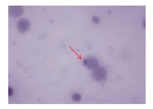
Fig. (1): Photomicrograph showing micronucleus (at 400X magnification) induced at higher percentage by the treatment of mice by 2-butoxyethanol at two different doses. Quercetin (antioxidant) was found to reduce this percentage and its effect was better at 14 days than that of 7 days.