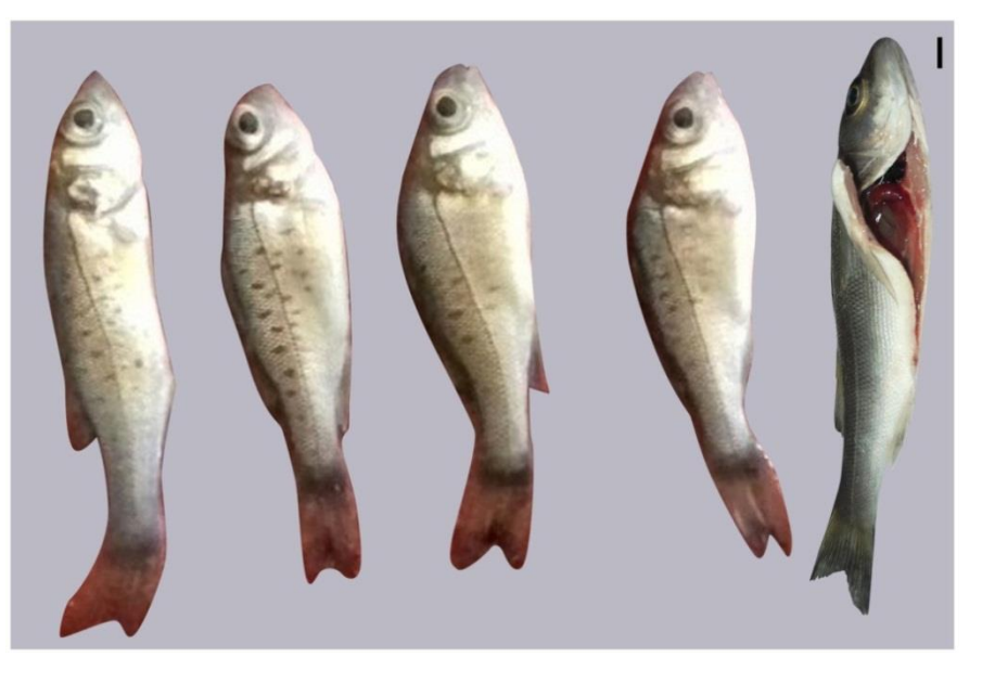
Figure 2: D. labrax fingerlings infected with Transversotrema haasi , showing debilitation, erosions, and anemic discoloration of the internal organs. The scale bar is 1 cm.