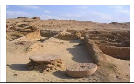
Fig. 3: An olive press in Karanis when it was discovered in the last century.