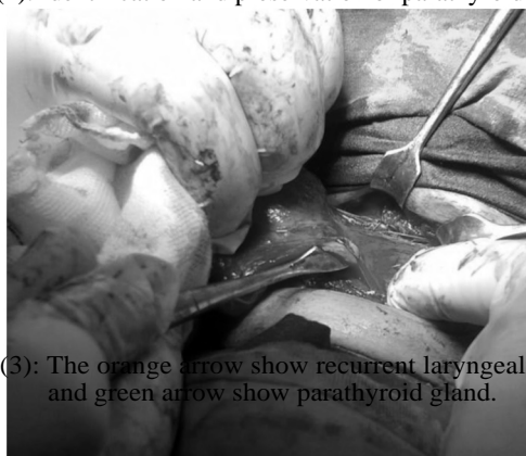
Fig. (3): The orange arrow show recurrent laryngeal nerve and green arrow show parathyroid gland.