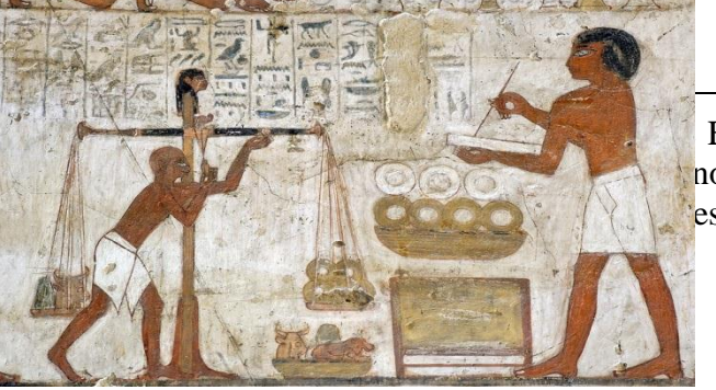
Egyptian noted that esearcher.