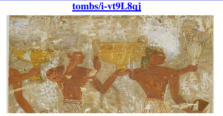
Fig. 3 Cretans Bringing Gifts, from Tomb of Rekhmire (Facsimile) New Kingdom (circa 1479–1425 B.C.) https://commons.wikimedia.org/wiki/File:Cretans Bringing Gifts, Tomb of khmire MET_DT10882