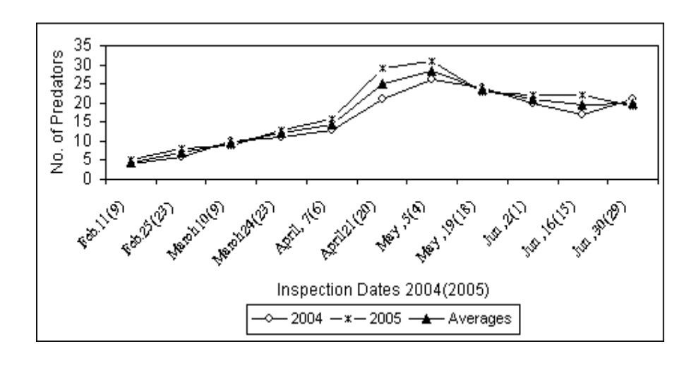
Fig. 4. Occurrence of number of predators on peach twig borer Anarsia lineatella during two successive seasons of 2004 and 2005.