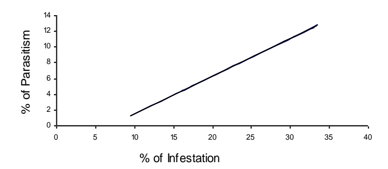
Fig. 3. Regression line between % of infestation by peach twig borer and % of associated parasites