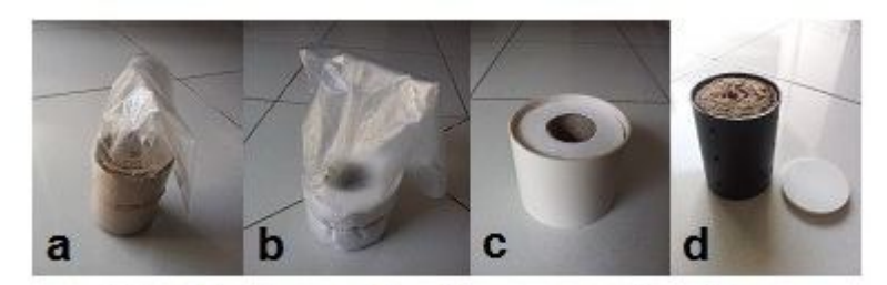
Fig. (1): Traps of subterranean termites