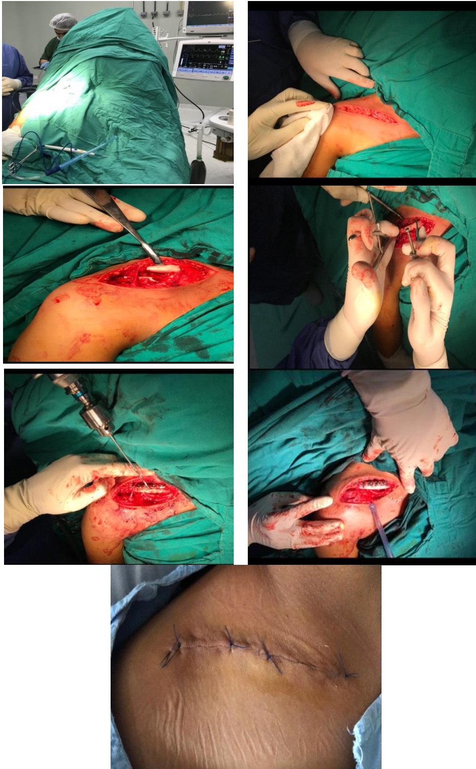
Figure (1): Steps of surgical technique

Once all of the screws have been inserted, the field