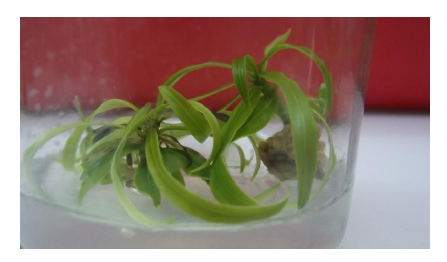
Photo 2. Multiplication stage of newlyformed Thevetia shoots of initiation stage cultured on WPM + 3.0&4.0 mg/l KIN+0.50mg/l NAA

recorded with MS+ 1mg/l NAA. In vitro elongated shoots rooted on MS medium supplemented with IBA (0.5mg/l) (Zibbu and Batra , 2010.).