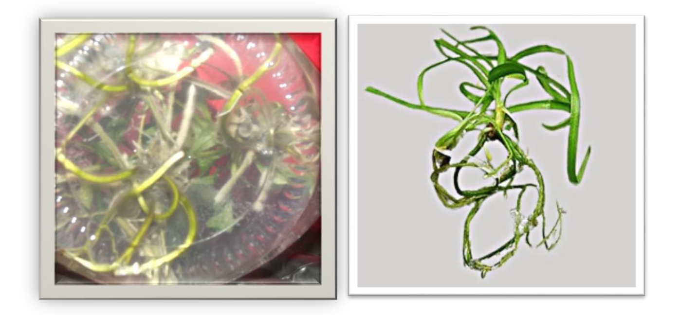
Photo 3. Rhizogenesis of Thevetia microshoots in the multiplication stage, upon culture and after for 35 days on WP medium fortifited with 2.00mg/l IBA and 0.50mg/l NAA