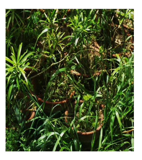
Photo5. Acclimatized Thevetia tissue culture plants derived from plants ex vitro