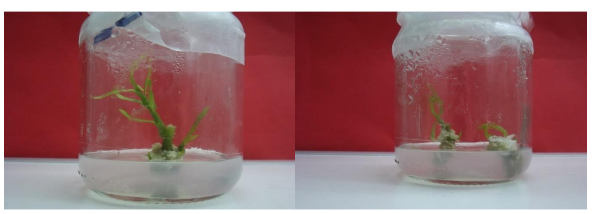
Photo 1. Initiation stage of Thevetia nodal explants cultured on WPM at 2mg /l NAA only