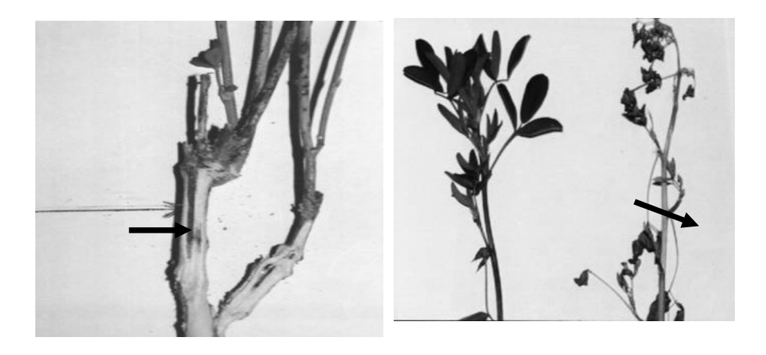
Fig. 1. Symptoms of stem infection by ( F. oxysporum ).