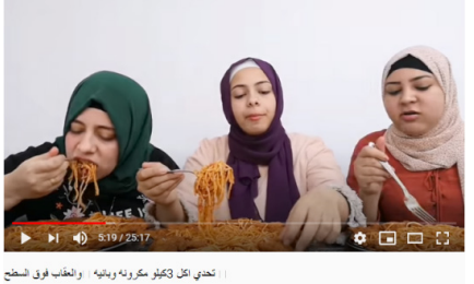
ا تحدي اهان دهيو محرونه وبنيه او انعاد وي استمع 1.34 م (1.34 م (1.34 م (1.34 م (1.34 م (1.34 م (1.34 م (1.34 م (1.34 م (1.34 م (1.34 م (1.34 م (1.34 م (1.34 م (

"I bought a lion for my wife. He will live at home with us."