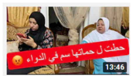
حطت ل حماتها سم في الدواء □ (الدين □المعامله) واول ظهور ل وجه جديد 2M views + 5 months ago