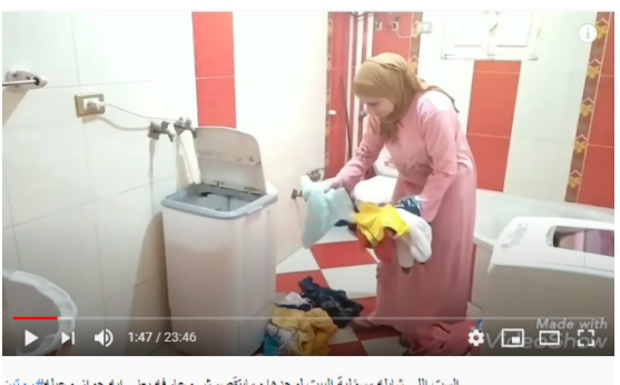
الست اللى شايله منولية البيت لوهندها ومايتقصر ش و هار فه يعنى ايه جواز و مولاً الير ويُنِن 4,085,207 views • Dec 4, 2019 6.1K ← SHARE =+. SAVE •••