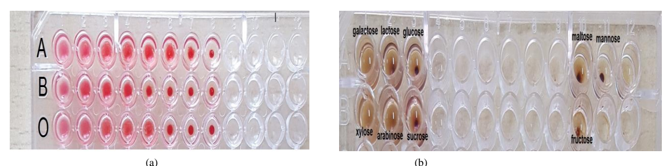
Fig. 1. (a) agglutination activity assay in the presence of the crud extracted Truffle Terfezia sp. for each blood group (A, B, O). (b) Sugar specificity assay of the crude extract of Truffle Terfezia sp. lectins showed the inhibition of hemagglutination for the sugars that have specificity for the lectins and non-inhibition of hemagglutination for the sugars that not have specificity or the lectins.

Sugar specificity for the crude extracts was tested by inhibition of hemagglutination. Glucose, mannose, maltose, sucrose and fructose showed inhibition. D-Galactose, arabinose, xylose and lactose were all have non-inhibitory effect (Figure. 1). These result shows that lectin's specificity from Truffle Terfezia sp. is similar to Cajanus cajan root and seed lectins results [24].