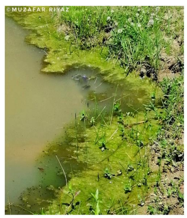
Image 1. A natural pool full of rainwater formed inside the sanctuary