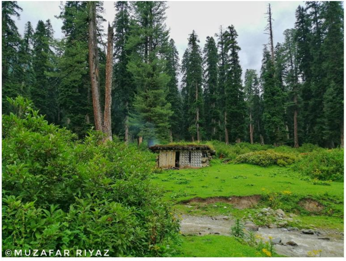
Image. 2 A tribal hut and a stream flowing through Hirpora Wildlife Sanctuary