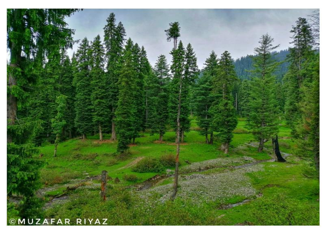
Image 3. A brook flowing between Abies pindrow (West Himlayan Fir) Trees in Hirpora Wildlife Sanctuary