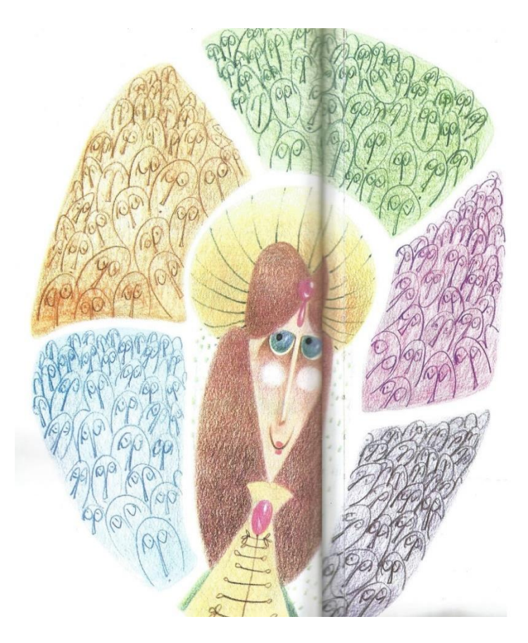
Figure. 4: Sultana surround by her people organized in groups

On the other hand, Pereira (2008, p. 110) highlights the significance of the position of characters in illustrations. To apply this concept to the story, the position of Sultana Habbahana in the middle of the illustration with two of her four children on both sides gives her prominence in the picture. This location highlights her position and gives the child reader the impression of the centrality of her status in the kingdom particularly with the absence of her husband Sultan Nabhaan. Moreover, this can be applicable to her four children depicted around her with the older offspring closer to her and the younger on both sides as shown in figure. 5.