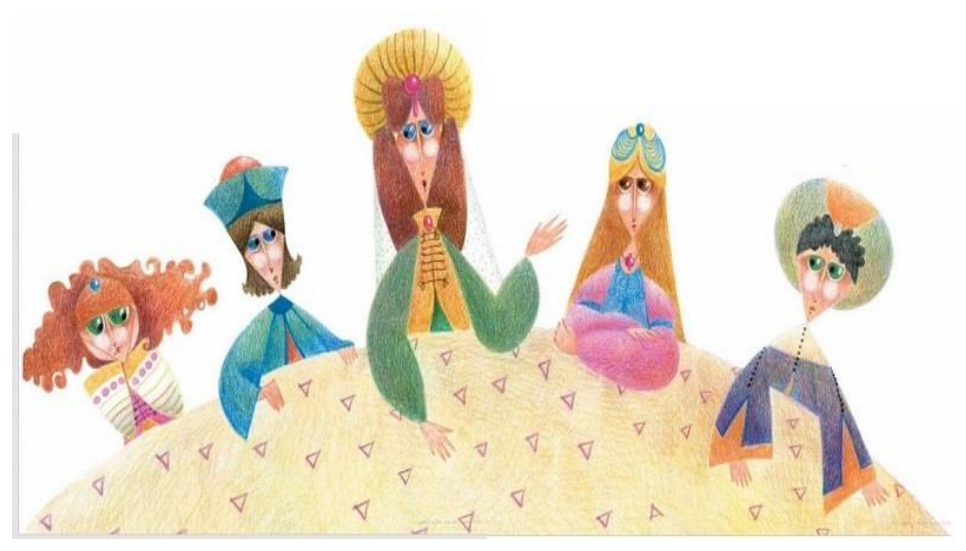
Figure. 5: Position of Sultana in the center of her family

Interestingly, <u>Dabaghi and Mohammadi (2011</u>, pp. 29-30) contend that Kress and Leeuwen postulate that the elongation of the shapes, whether horizontally or vertically, can suggest different meanings. For example, vertical elongation concentrates the distribution between top and bottom that creates some tendency towards hierarchy: the top for the most important and the bottom for the less important. To apply this technique to the story, on pages 30 &31 to the very end of the book, Sultan Nabhaan appears, finally, in the story in very big shape with an aura around his head, in some exaggeration, splitting the written text into halves. With the use of vertical elongation in illustration, Sultan Nabhaan's figure symbolizes his great status among his people who looked so small compared to his gigantic figure as shown in figure. 6.