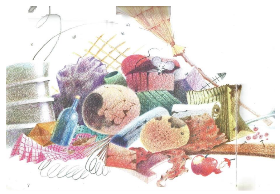
Figure. 2: Position of broom denotes uncleanliness of the city

stand for the whole. Pereira maintains that this technique can be applied to illustrations as well: illustrators can make choices, and select only certain aspects or scenes or passages in the text to present in the pictures, which will represent the text as a whole. Accordingly, on page 7 of the ST of Sultan Nabhaan, the idea of cleaners who no longer clean city streets is referred to by a broom that is left amid the rubbish in an upside-down position. The neglected broom was selected to represent the whole idea of uncleanliness and dirt that spread all over the city as shown in figure. 2.