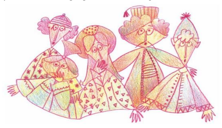
Figure. 1: Common People wearing unfamiliar clothes

do not look this way in the Arab world; the Arab children do not see these figures in every day's life. It might be that the illustrator would like to add a touch of surrealism to the characters. Moreover, people are not dressed in the way they are dressed in the pictures nowadays in the Arab world neither royals nor common people as shown in figure. 1.