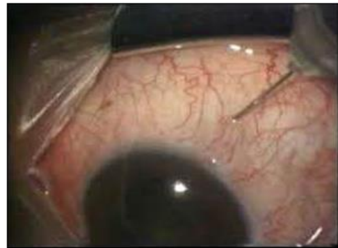
Figure 1: Intravitreal injection in superior temporal quadrant.